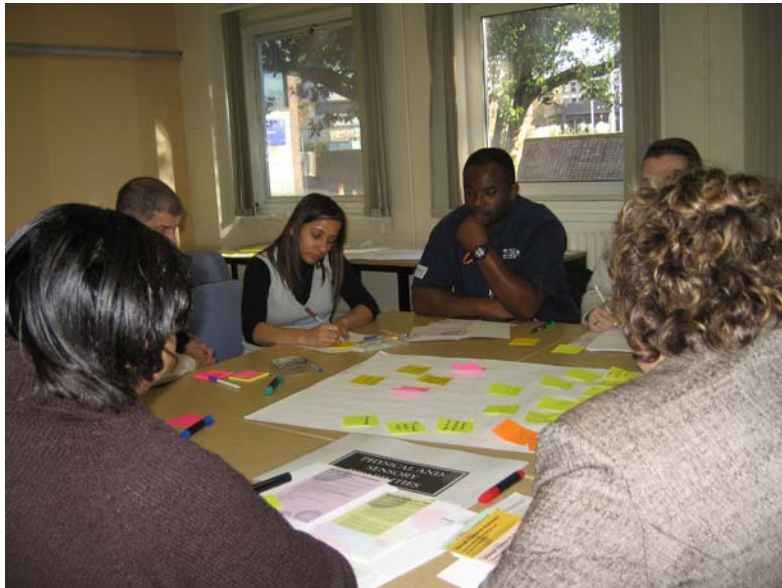
The Disability and Sensory Needs Workgroup thought Partnership meant "Working together for the good of everyone in Slough"