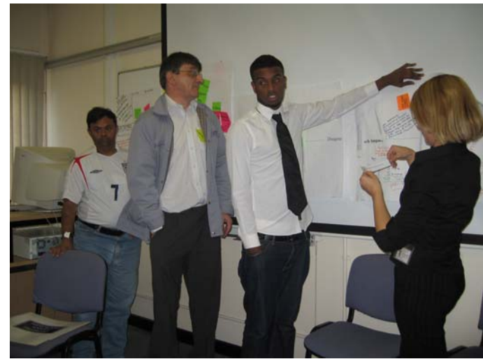
"Keep it simple and precise" was the message from Communication Workgroup