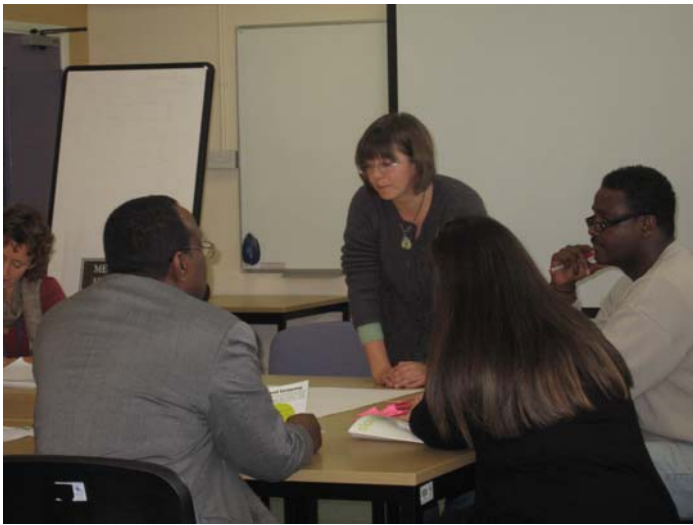
The Mental Health Workgroup's "top values" were respect, consistency, equality, integrity and honesty