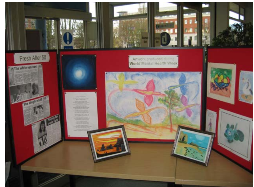
Display of art from World Mental Health Week