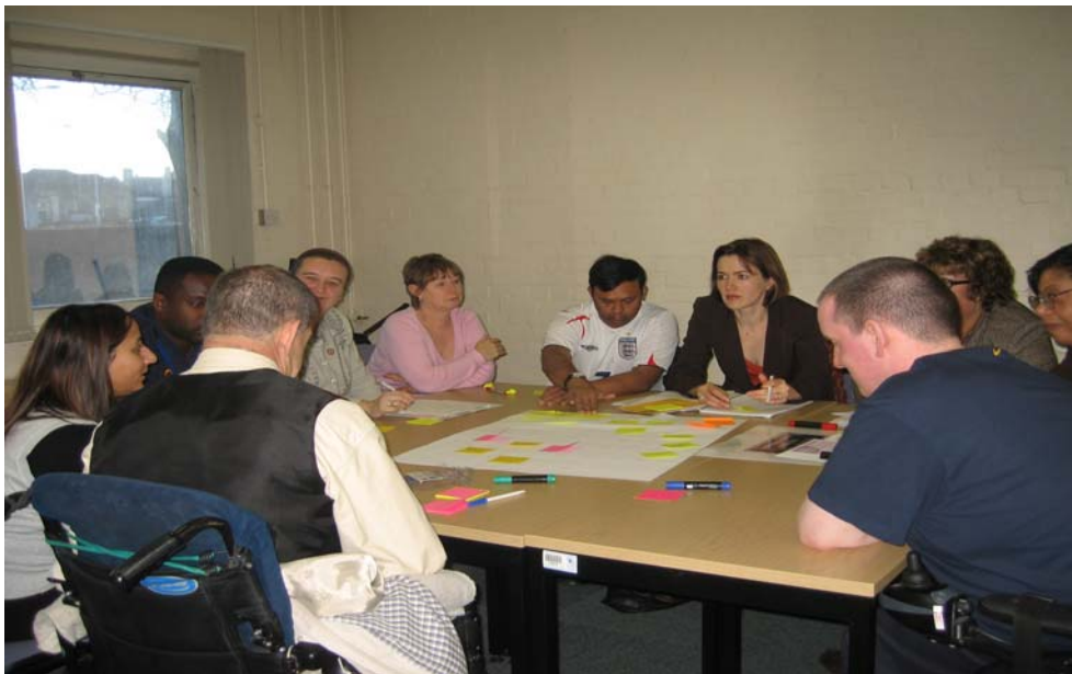
The Community Care Forum provides an opportunity for the voluntary sector to input on issues affecting older people, carers and people with physical and mental health issues.