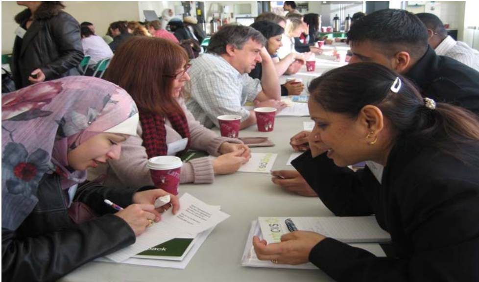
Speed networking at In Good Company event allowed community groups to meet with each other and people from the statutory sector.