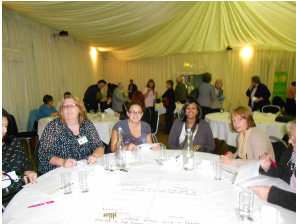
Delegates at the event