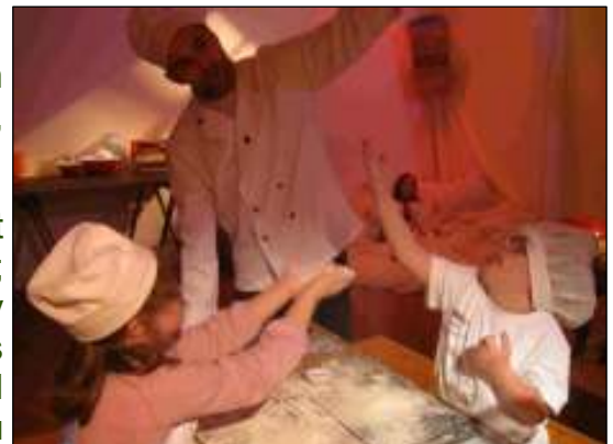
The Bakery – an InnerSense themed work-