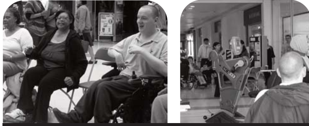
2008 Disability Awareness Day photos

Friday 26th June 10.00am - 3.00pm Elliman Square Queensmere Shopping Centre Slough