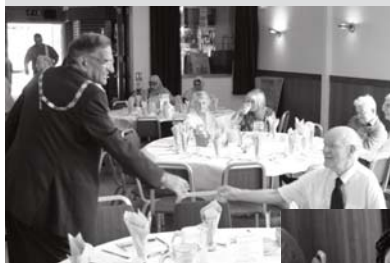
Carers' Lunch 2010 Top: Slough Mayor, Cllr. Jagjit Grewal meeting guests Below: Fiona Mactaggart MP for Slough